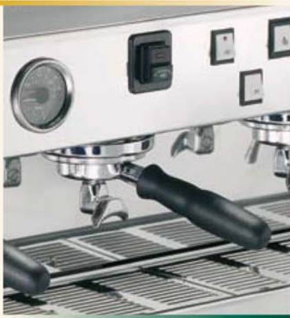
The picture shows the semi-automatic (EE) configuration. All specifications are subject to change without notice.

High wattage elements not available on 200V 3phase & 220V 3phase 4 groups models.